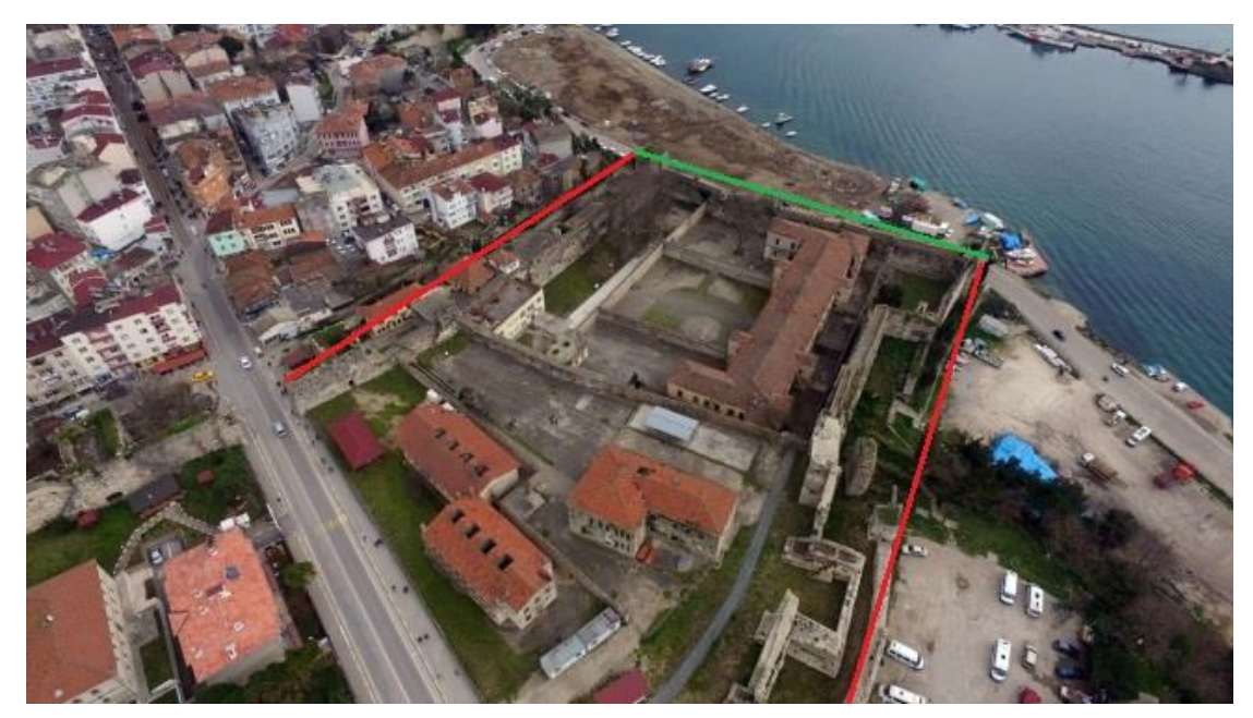
Figure 1: Transect lines along the Sinop historical prison walls.

Individuals were observed during herpetological surveys in July and August 2014. First observation was recorded on the 12th July 2014 at 00:20 a.m. We observed two male and two female Spiny-tailed lizard, Darevskia rudis , active and foraging at night on the walls of the Historical Sinop Prison, Turkey (36T 677448 E, 4654818 N; 15 m asl). The air temperature was 25°C, recorded by AccuWeather Superior Accuracy<sup>TM</sup> on the first night. Since that time, this activity pattern was recorded continuously until the end of August 2014. The ambient air temperatures varied in a narrow range (mean temperature: 26.4 °C) during these night surveys. The walls were illuminated by the powerful long-range field scanning projectors (approximately 1000W each). The walls were built from ashlar blocks (in the 13<sup>th</sup> century) and were covered with infrequent grassy vegetation. Under these conditions, the 2x250 (red lines) and 1x150 (green line) meter transects along the prison walls were set up in the east-west direction, and surveyed by at least three observers (Figure 1).