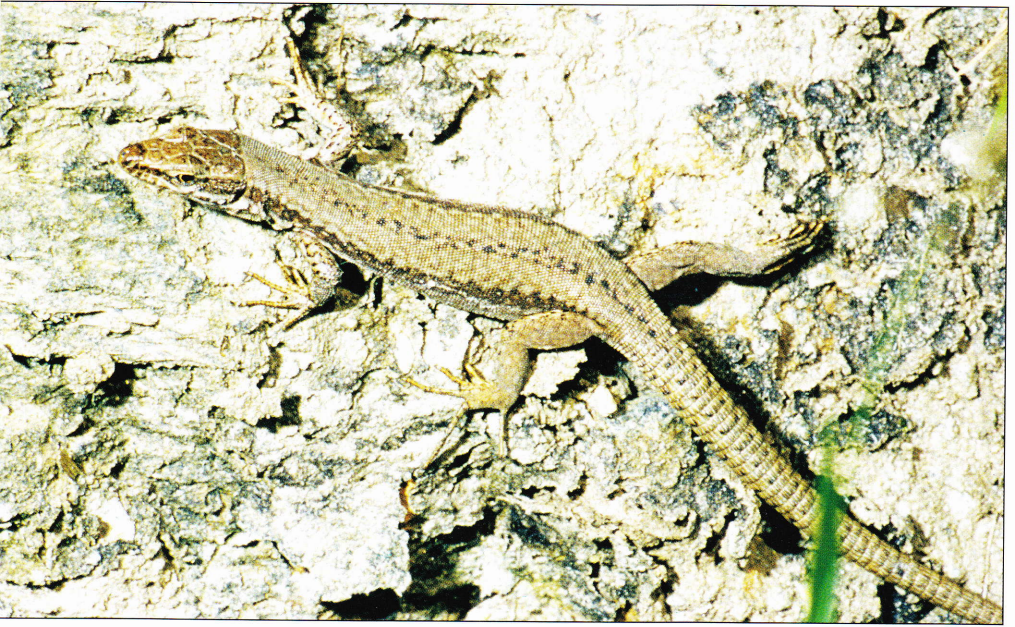
Fig. 60: Podarcis muralis , Lolair, Aosta.