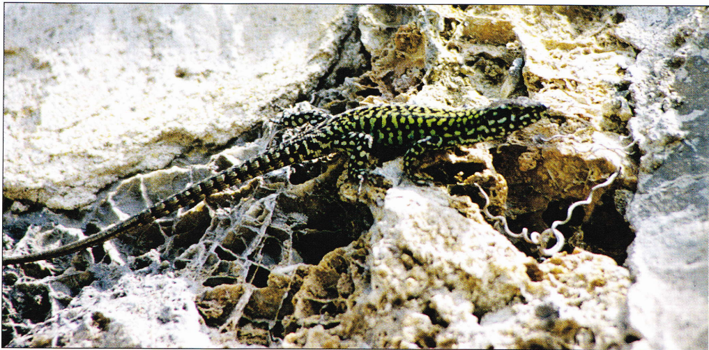
Fig. 63: Podarcis muralis , Campagnatico, Tuscany.