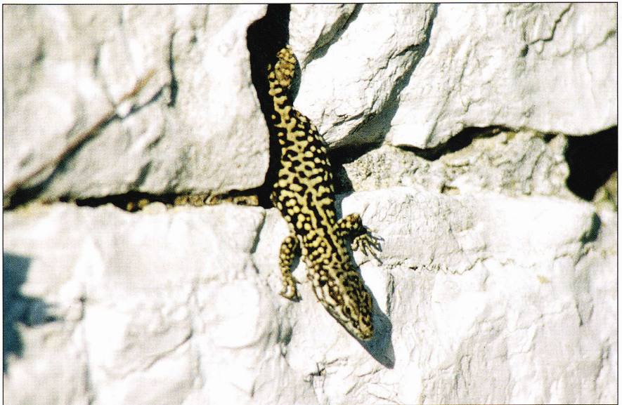
Fig. 65: Podarcis muralis , Vrsac, Croatia.