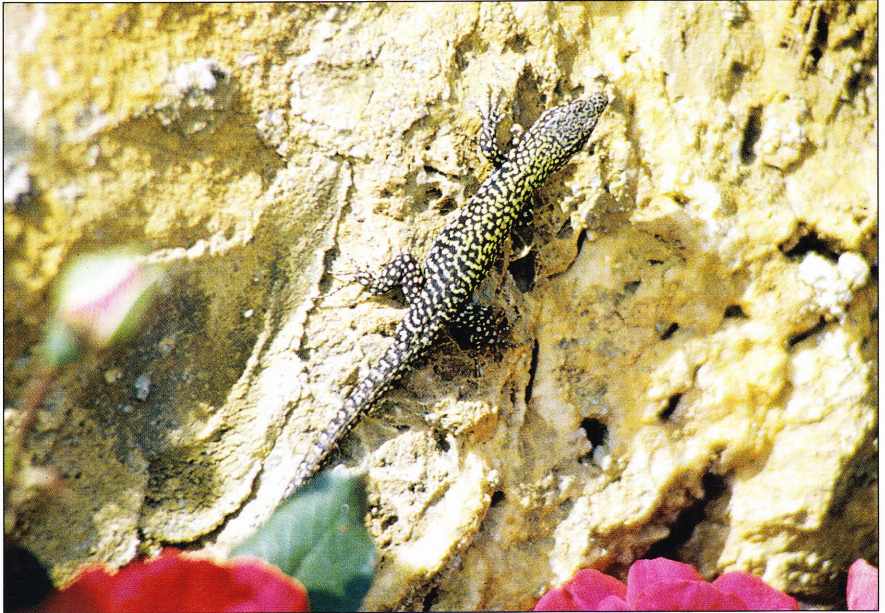
Fig. 64: Podarcis muralis , Campagnatico, Tuscany.