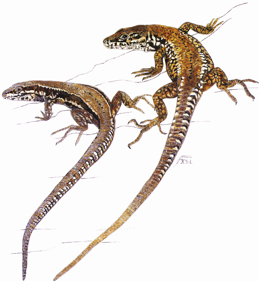
Fig. 66: Pair of Podarcis muralis .