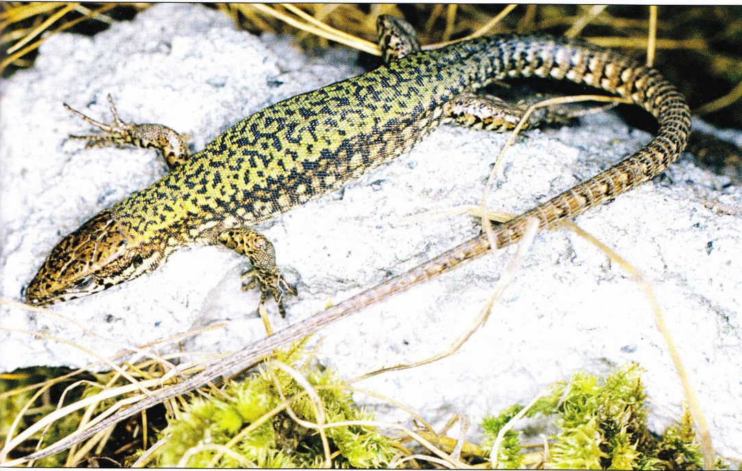
Fig. 62: Podarcis muralis , Portofino, Liguria.