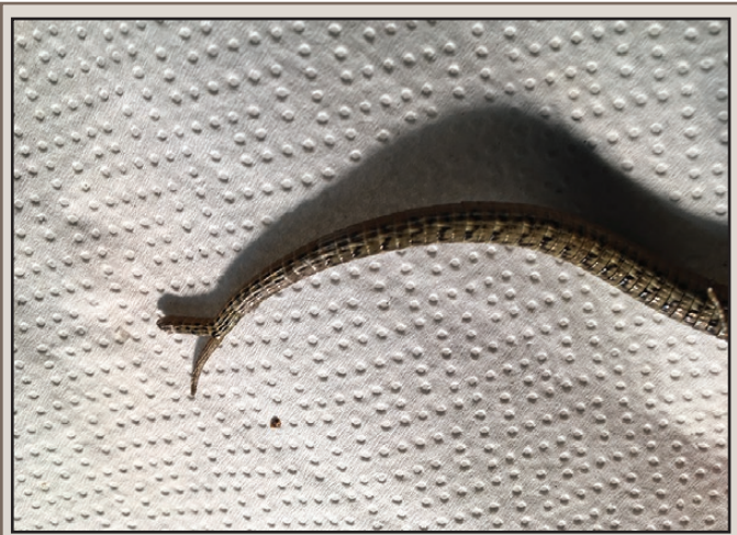
FIG. 2 Tail bifurcation in Podarcis muralis (female individual).