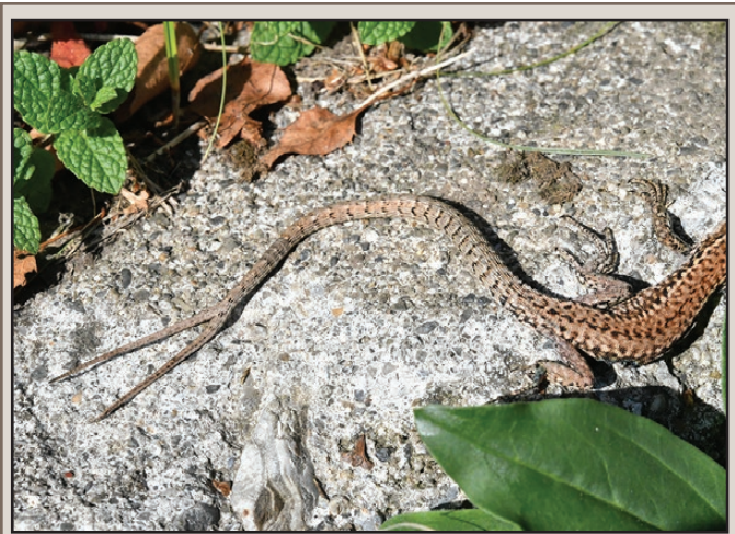
FIG. 1 Tail bifurcation in Podarcis muralis (male individual).

Caudal autotomy is an anti-predatory adaptive strategy (Clause et al. 2006. J. Exp. Zool. 305A:965–973). By shedding their tail, lizards can increase their immediate locomotor performance allowing them to escape more efficiently, while potentially distracting the predator with the lost limb (Brown et al. 1995. J. Herpetol. 29:98–105). However, this strategy does not come without a cost; tail breakage can result in decrease in growth rate, loss of social status, or decline in arboreal locomotion (Bateman and Flemming 2009. J. Zool. 277: 1–14). Lizards having previously lost their tails seem to be able to learn from experience and outweigh these costs more skillfully than individuals shedding their tail for the first time (Brown et al., op. cit. ). Tail bifurcation results from partial caudal autotomy when a new tail does not grow directly in the alignment of the original tail (Arnold 1988. In Gans and Huey [eds.], Biology of Reptilia, pp. 235–273. Alan R. Liss, New York).