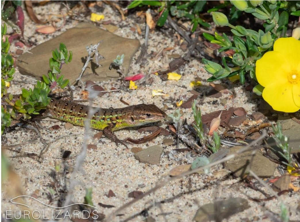
Male, P / Bordeira, 15.04.2017; These lizards are beautiful - but small, as the Helianthemum flower in the right part of the picture illustrates.