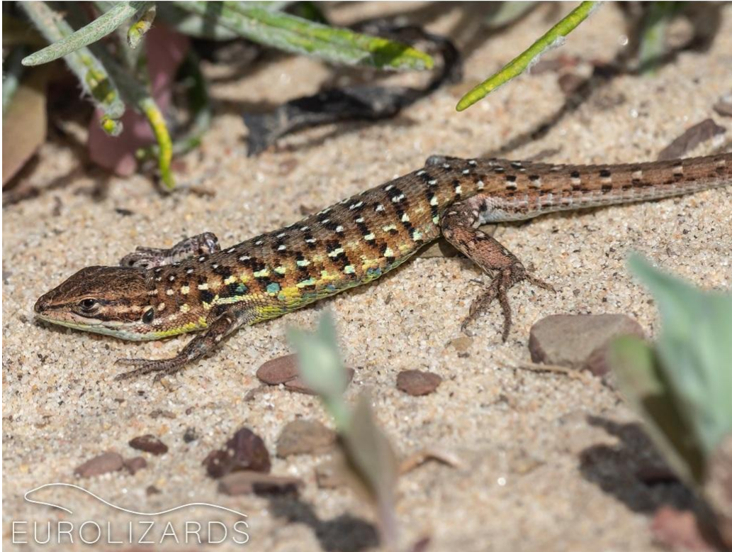
Male, P / Bordeira, 17.04.2017; During breeding season, males show bright colours.

The Western Psammodromus is maybe the most secretive of the three small Spanish Psammodromus species. It occurs on the western Iberian Peninsula only.