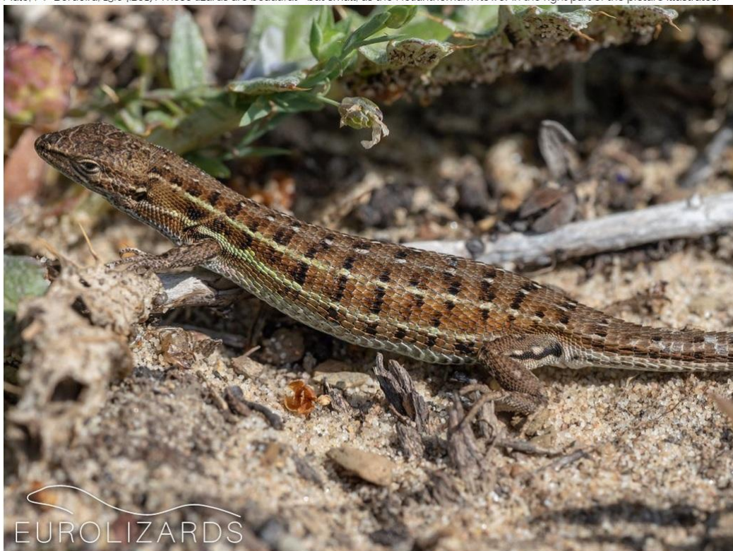
Female, P / Bordeira, 15.04.2017