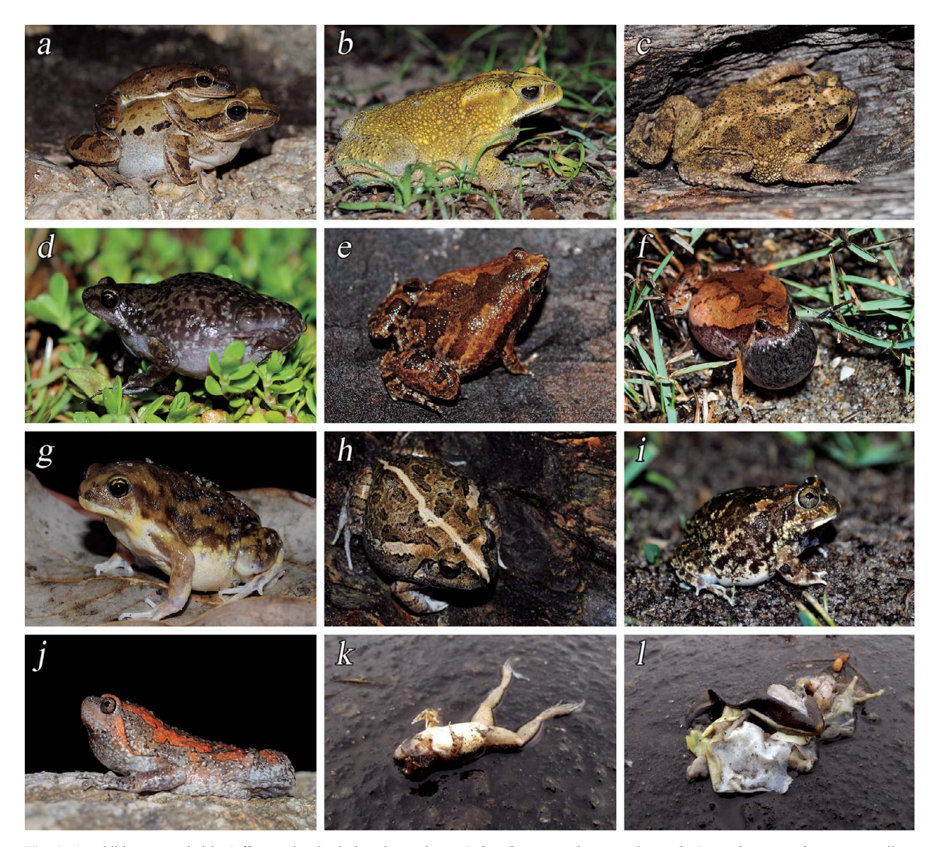
Fig. 4. Amphibians recorded in Jaffna peninsula during the study: a , Polypedates maculatus amplexus; b , Duttaphrynus melanostictus yellow color morph; c , Duttaphrynus scaber ; d , Uperodon rohani ; e , Microhyla ornata ; f , Microhyla mihintalei ; g , Uperodon systoma ; h , Sphaerotheca breviceps ; i , Sphaerotheca rolandae ; j , Uperodon taprobanicus at Delft Island; k , a roadkill specimen of Hoplobatrachus crassus ; l , a roadkill specimen of Hydrophylax gracilis roadkill at Karaveddai.

overall abundance (n = 123) of all herpetofauna while saltmarshes had the lowest overall abundance (n = 8). The highest species richness and abundance of amphibians was recorded from inland waterbodies; the equivalent figure for reptiles was recorded in monoculture plantations (Fig. 5).