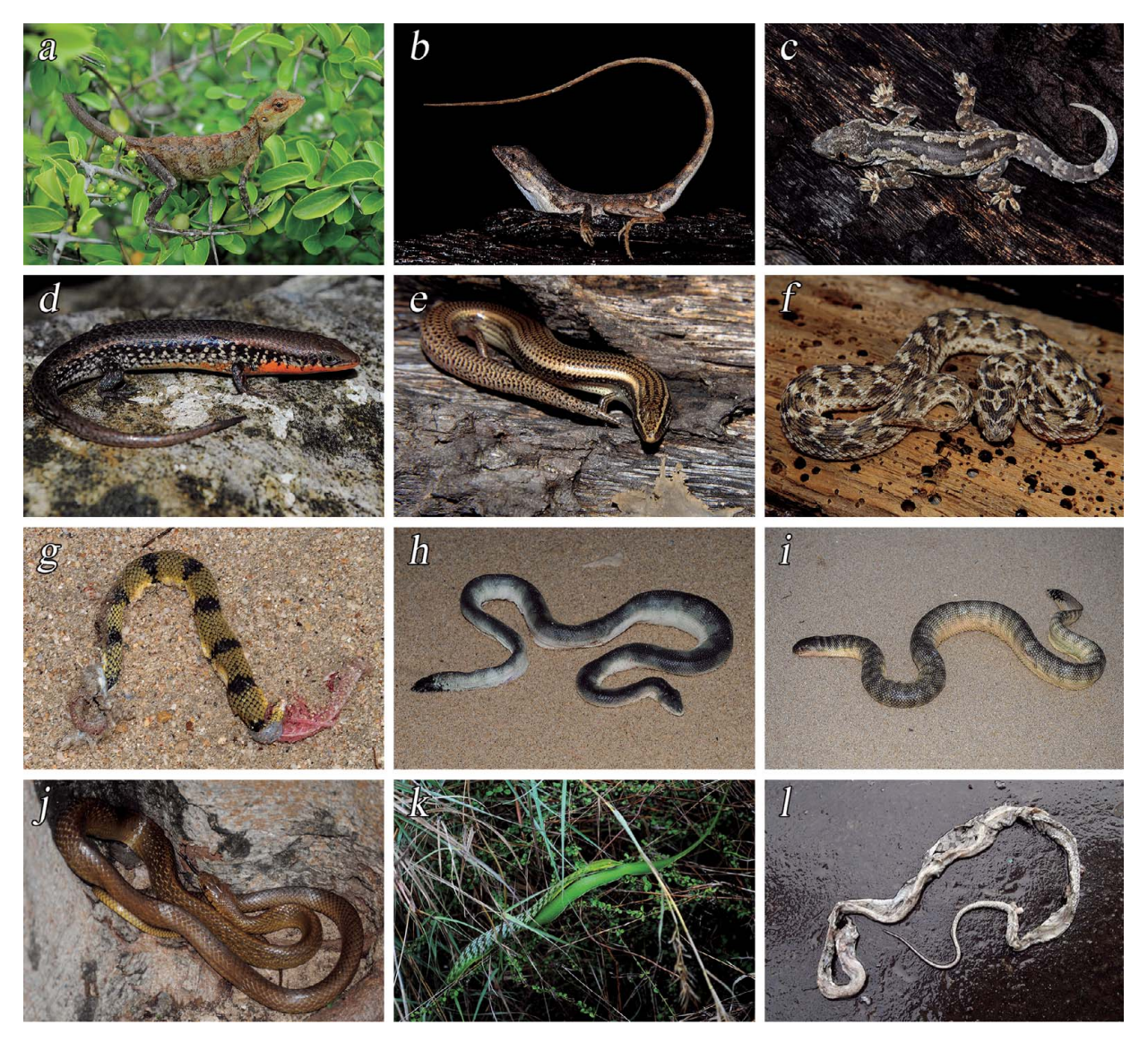
Fig. 3. Reptiles recorded in Jaffna peninsula during the study: a , Calotes versicolor female at Delft Island; b , Sitana cf. devakai adult male; c , Hemidactylus leschenaultii ; d , Eutropis tammanna male; e , Lygosoma punctatus ; f , Echis carinatus ; g , Hydrophis spiralis (killed by fishermen); h , Hydrophis viperina ; i , Hydrophis curtus ; j , Ptyas mucosa at Palali; k , Ahaetulla nasuta at Kopaiy; l , Boiga ceylonensis roadkill at Pallai.

rufogulus ), Dasia haliana , and Lycodon carinatus (formerly, Cercaspis carinatus ) were not recorded despite been mentioned in earlier records. The amphibian communities of Jaffna peninsula were represented by five anuran families. The three endemic amphibians found in our study was the ranid Hydrophylax gracilis , Microhyla mihintalei , and Uperodon rohani . Among the amphibians in our checklist, Duttaphrynus scaber is considered vulnerable according to the national Red List (Fig. 4). No "globally threatened" amphibians occurred in Jaffna peninsula.