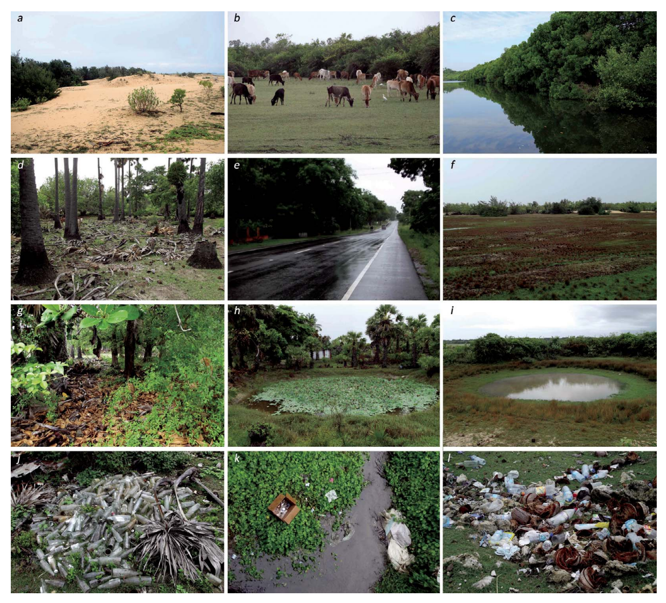
Fig. 2. Major habitat types of the study region of Jaffna peninsula, Sri Lanka: a , coastal beaches at Maruthankerni; b , grasslands at Karaveddai; c , mangroves at Elluthumaduval; d , monoculture plantations at Delft Island; e , road verges; f , salt marshes at Kayts; g , scrub forests; h , natural inland water bodies; i , artificial inland water bodies at Aliavalai; and waste disposal sites at Delft Island ( j ), Valigamam ( k ), and Elathumaduval ( l ).

and 79^{\circ}36'28.12'' - 80^{\circ}45'06.18'' E) with elevations ranging from 1 – 10 m (Fig. 1). Biogeographically, Jaffna Peninsula lies within the low country dry zone (average annual temperature 29.5°C, annual average precipitation 910.5 mm). The geological substrate of Jaffna peninsula is limestone as this region was submerged in the Indian Ocean during Miocene. The climate and hydrology of Jaffna peninsula is largely dependent on monsoon rains. Annual precipitation ranges from 696 mm to 1125 mm and more than 90% of the annual rainfall results from the north-east monsoons during the shorter wet