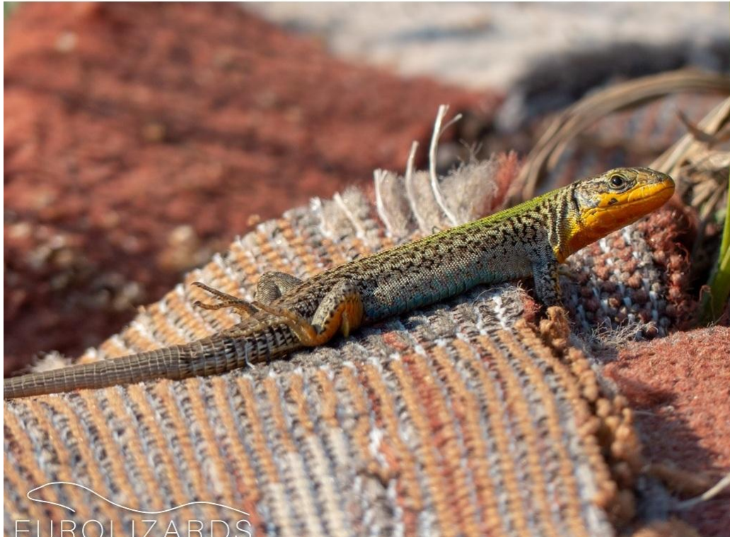
Subsp. fiumanus , male: MNE / Virpazar, 9.7.2015 - Some specimens show bright orange throats.

Podarcis melisellensis has been named after "Melisello" - the former name of Brusnik, a small islet in the Croatian Vis Archipelago -, as the initial description of this species referred to this islet's lizards.