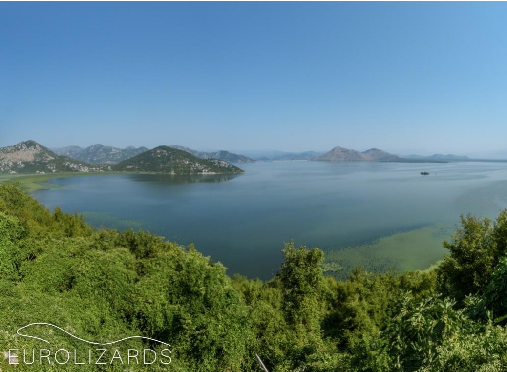
The shores of Skutari Lake (Montenegro): Habitat of Podarcis melisellensis , Lacerta trilineata and Dalmatolacerta oxycephala .