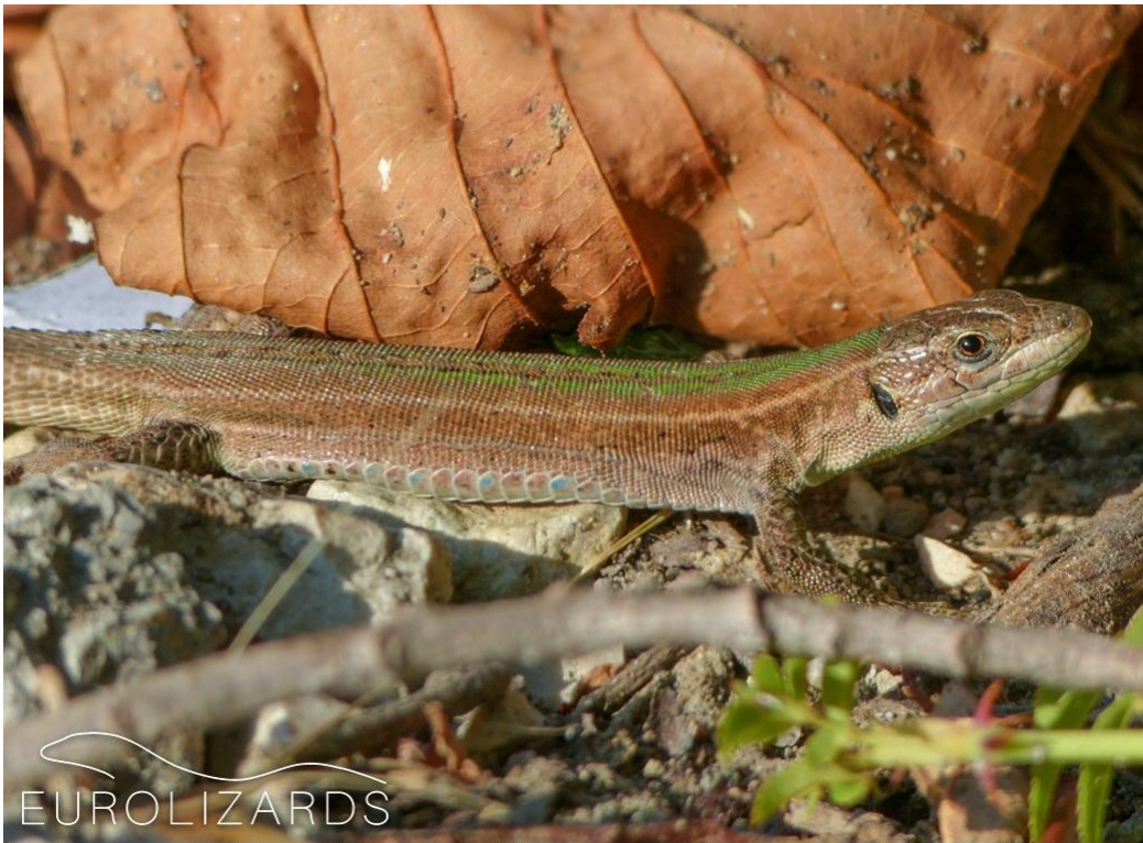
Subsp. fumanus , subadult: Montenegro / Ulcinj, 28.07.2012 - This species may resemble to Podarcis siculus but is significantly smaller.