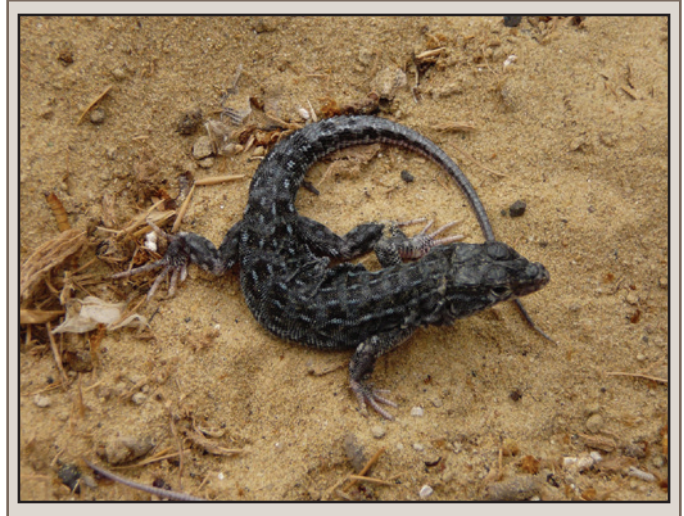
FIG. 1. Dark-colored specimen (incomplete melanist) of Eremias ar guta from Voronezh Oblast, Russia (from Modnov and Goncharov 2018, op. cit. ).

On 9 June 2021, in the Uglovsky District, Altai Krai, Russia (51.35114°N, 80.32001°E; WGS 84; 220 m elev.) we found a gravid, melanistic adult female E. arguta near the Rubtsovsk-Uglovskoe-Mikhailovskoe Road (Fig. 2). We captured and kept the lizard in a terrarium, with a mixture of sand and clay substrate in a ratio of 3:1, along with a cut piece of bamboo. On June 26, the female laid a clutch of 3 eggs (egg dimensions: 15.07 \times 10.2 mm, 0.99 g; 16.02 \times 10.3 mm, 1.03 g; 16.04 \times 10.5 mm, 1.04 g) in a damp