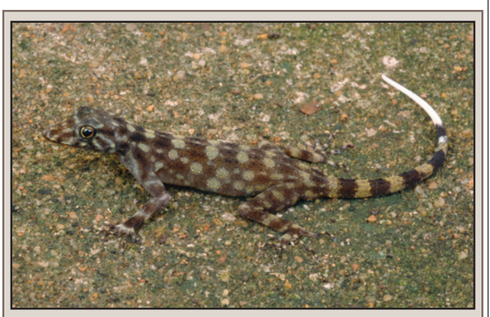
FIG. 1. An adult Cnemaspis caudanivea from Hon Tre Island, Kien Hai District, Kien Giang Province, Vietnam, collected on 9 December 2005.

males and the ovaries were examined to see if yolk deposition was in progress in the females. Histology slides were deposited at LSUHC.