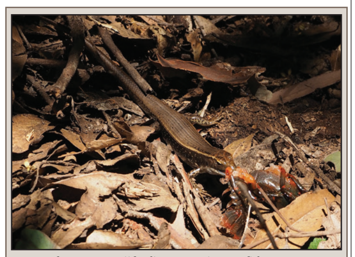
Fig. 1. Eulamprus quoyii feeding on a spiny crayfish ( Euastacus sp.), from Blue Mountains, New South Wales, Australia.

EULAMPRUS QUOYII (Eastern Water Skink). DIET and FEED-ING BEHAVIOR. Eulamprus quoyii is a medium-size skink (up to 115 mm SVL) occurring in or near various aquatic habitats over most of Australia's east coast (Wilson and Swan 2007. A Complete Guide to Reptiles of Australia. Fifth edition. Reed New Holland, Chatwoods, New South Wales. 647 pp.). The species is a