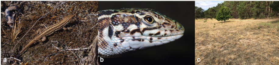
Figure 2. doi

haplotypes differ in three sites). All of them are unique, first reported, novel haplotypes of Podarcis tauricus (cf. Psonis et al. 2017, Psonis et al. 2018) (alignment of 257 bp, 98.44-100% similarity, 0-3 mismatches with cytb sequences from Psonis et al. 2017). The cytb sequences from the individuals from the Czech Republic are very close to cytb sequences from individuals from Albania, Hungary, Kosovo and Serbia (alignment of 257 bp, 100% similarity with cytb sequences from Psonis et al. 2017). We can conclude that the studied population from Czech Republic is phylogenetically closely related to these populations (Fig. 3).