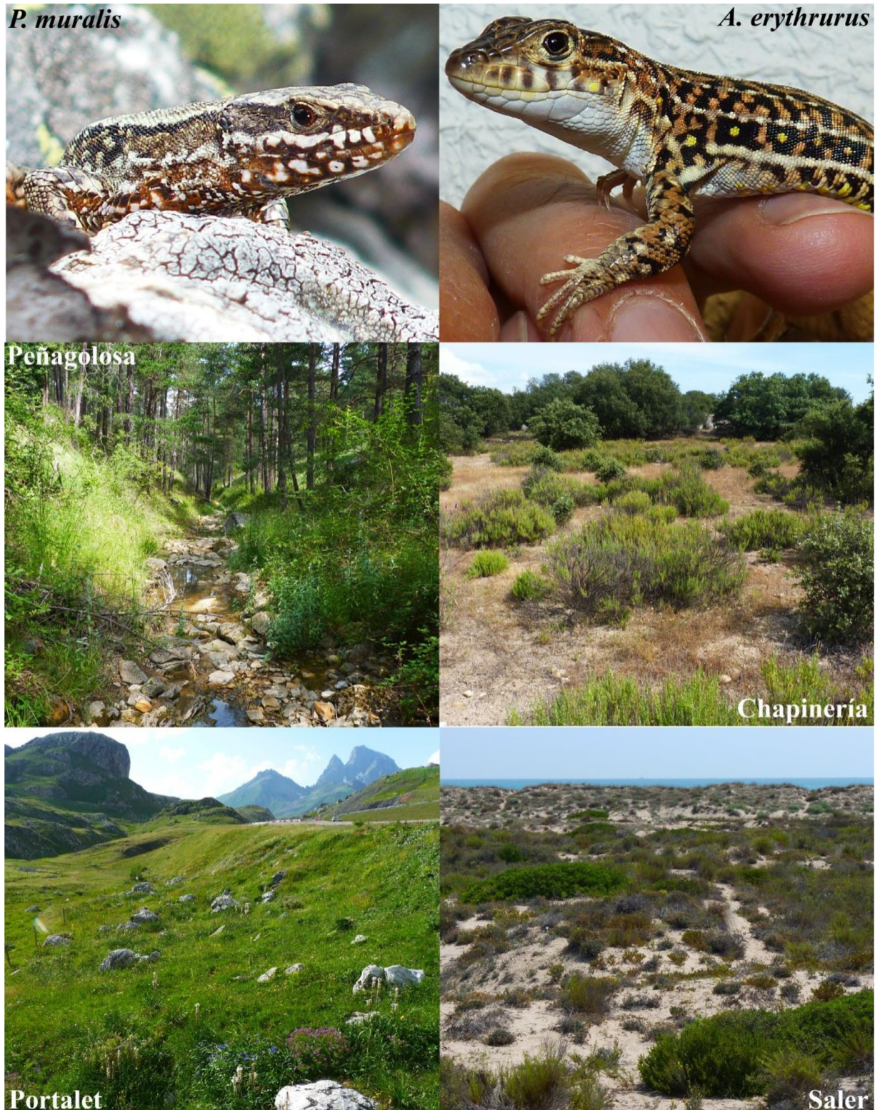
Fig. 1. Adult males of the two study species: the spiny-footed lizard Acanthodactylus erythrurus and the common wall lizard Podarcis muralis along with the four study localities in the Iberian Peninsula.

become active in sunny days at ~10:00 AM–12:00 PM at the two study sites when dew has already evaporated. The latter species is mostly inactive on cloudy days (Belliure, 2015).