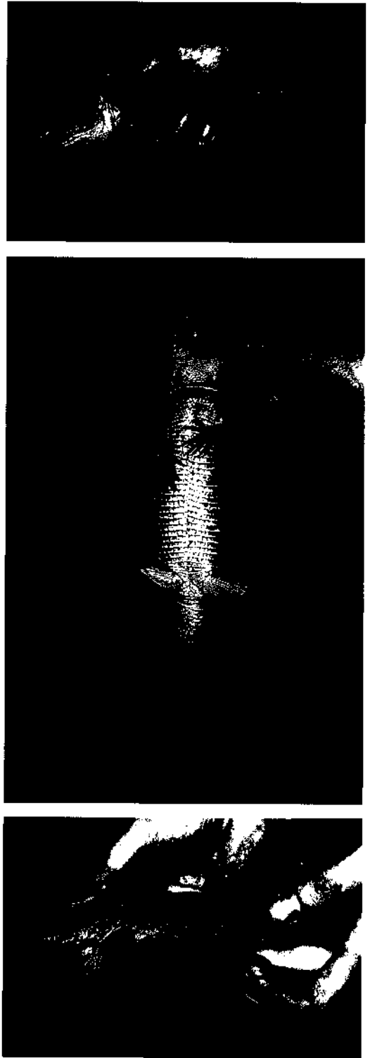
FIG. 3.— Gallotia gomerana . Adult male (top), adult female (middle) and juvenile (bottom).

limbs, and tail) and the presence of an elongated interprefrontal scale (Fig. 2), absent in the rest of species except in G. intermedia where they are generally smaller in size (see Fig. 3 (A) in Henández et al., 2000). This lizard also differs from the smaller species ( G. galloti , G. caesaris , and G. atlantica ) in having a higher number of longitudinal rows of ventrals (16–18 versus 8–14). Gallotia gomerana shows an uniform blackish-brown dorsum, ivory-white angular region, large tympanic scale, a lower