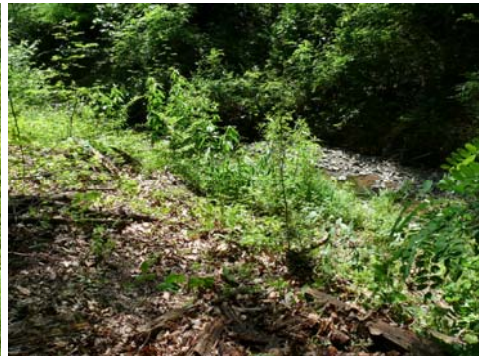
Figura 3. The D. pontica habitats near Iteu (left) and Toc (right).

area without plantations. We did not find any individual in the areas with coniferous plantations. Currently, the anthropogenic impact on the habitats of the species from the two localities is low, but forestry activities which continue even in the present may affect the populations all the more so as these are at the northern limit of the species' range. Also, the surface area occupied by the species north of Mureş is not known, but is probably reduced.