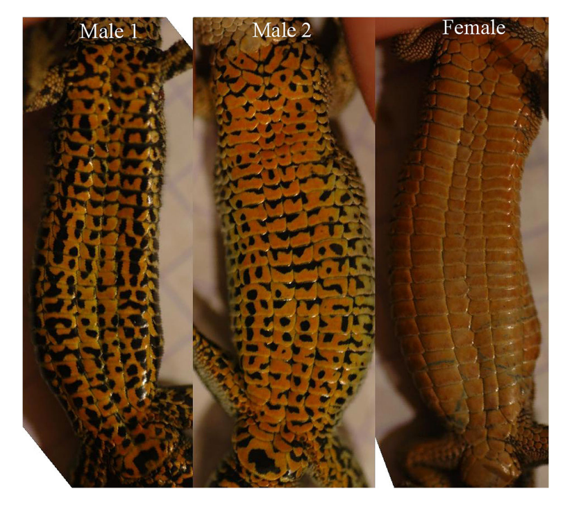
Figure 1. Pictures of the ventrum of two male and one female Zootoca vivipara , demonstrating the extent of the variation in the percentage of ventral melanin-based colouration. This figure is published in colour in the online version.

The reflectance spectra of the lizards were measured with an Avantes spectrometer (AvaSpec-2048-USB2-UA-50 (range 250-1000 nm), Avantes, Eerbeek, The Netherlands). The probe was held perpendicular to the skin surface. The measurements were expressed relative to a white reference tile (WS2, Avantes, Eerbeek, The Netherlands). The lizards' colouration was assessed by measuring the reflectance at thirteen positions: on the head (spot 1); dorsal, between the fore limbs (spot 2); mid-mid on the dorsum (spot 3); mid-lateral (both left and right; spots 4 and 5); lateral (both left