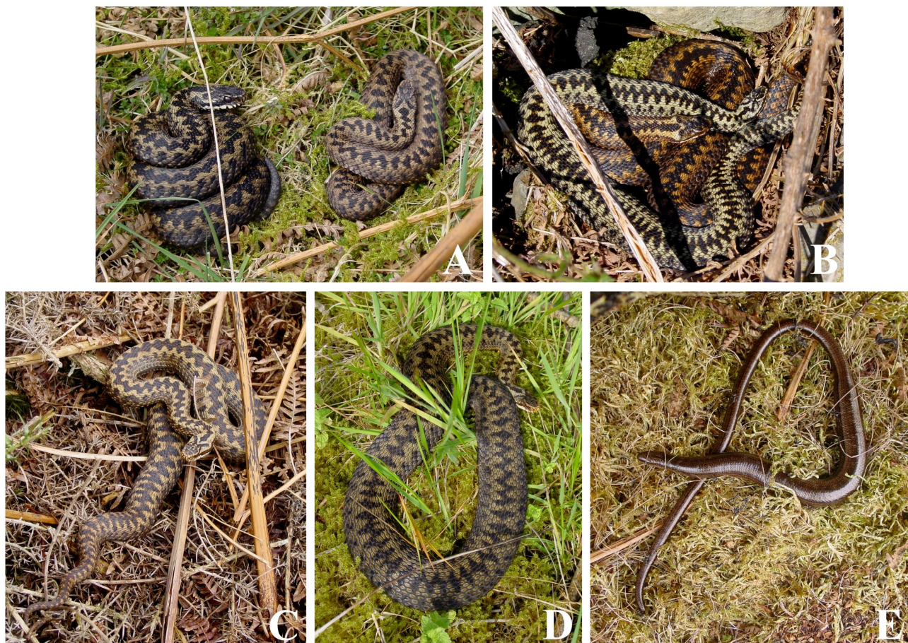
Fig. 2. a) Male and female adders Vipera berus (~40 cm in length), recently emerged from hibernation, 31 March 2012. b) Mating male and female adders (both ~60 cm), 15 April 2012. c) Gravid female adder (~60 cm), 22 April 2012. d) Gravid female adder (~60 cm) in a flattened posture to maximise absorbance of solar radiation, 20 June 2012. e) Gravid female slow-worm Anguis fragilis (~25 cm) found under a refugia mat, 25 August 2012.

sun for extended periods throughout the summer, even in cooler weather when they would flatten their bodies, to obtain maximum warmth from solar radiation (Fig. 2D), possibly to facilitate incubating gestating young (Vanning 1990). They only disappeared in early to mid September, likely to give birth, although this was not observed, and no young were found during this period. Occasionally, males would be seen through the summer period, but transiently at new locations, indicating that they were wandering. Males and small females reappeared in numbers in mid September at hibernacula, sunning for long periods, with the last seen on 21 October.