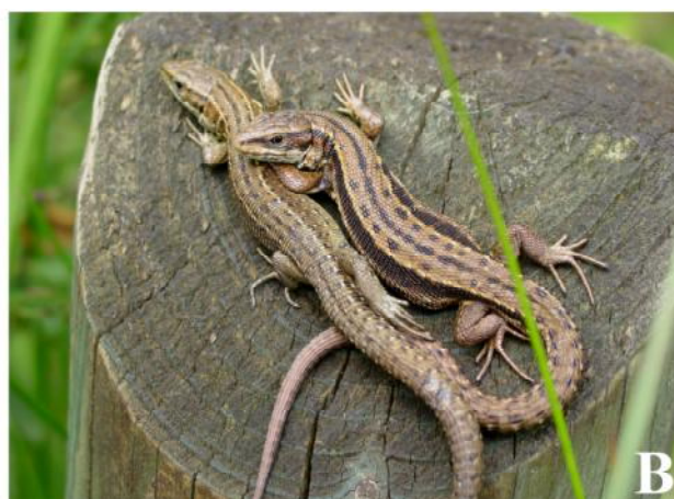
Fig. 3. a) Juvenile adder Vipera berus (~14 cm in length), recently emerged from hibernation, found under a refugium mat, 22 March 2012. b) Common lizards Zootoca vivipara (~13 cm), 17 August 2012.