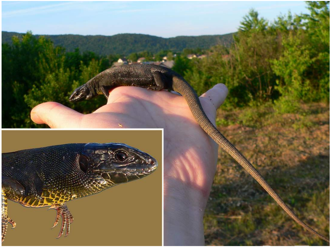
Figure 2. The melanistic Lacerta viridis . Lighter coloured ventral scales is visible here. Slika 2. Melanistični obični zelembać Lacerta viridis . Vidljive su svjetlije ventralne ljuske.