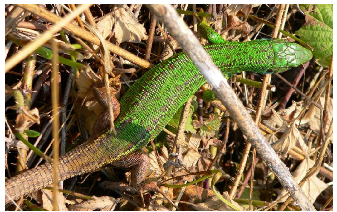
Figure 3. Normally-coloured L. viridis from the same locality. Slika 3. Uobičajeno obojen obični zelembać L. viridis s istog lokaliteta.