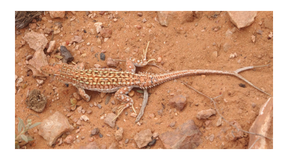
Figure 3. Adult male of Acanthodactylus spinicauda , Berr'mad, 50 km south of El Abiod Sidi Cheikh, Algeria (loc. 1b in Table 1), 22 April 2015.

The contemporary specimens conform perfectly to the characters given by Doumergue (1901) and Salvador (1982) and visible on the Paris syntype. The most remarkable feature is the widened and spiny tail basis of the male (Fig. 4). In females this character is less developed (Fig. 5) but the wide tail base and strongly keeled scales on the basis of the tail should allow easy distinction from similar species of the "Acanthodactylus pardalis species group", to which A. spinicauda belongs to according to Salvador (1982). Coloration is typical of the pardalis species group but males (Fig. 1, 3) differ from all other populations we have examined, alive or in photos, by the large elongated yellow spots on the back, which are closely spaced and tend to form broad