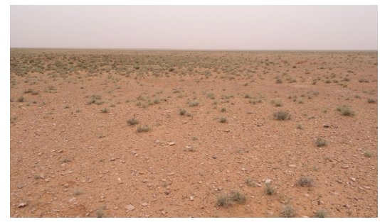
Figure 6. Habitat of Acanthodactylus spinicauda at locality 1b in Table 1.

lines on the dorsum and the back of the neck. The two innermost rows of spots are closer to each other than to the outer rows of spots (usually the opposite in the other species). The tips of the keels of the scales at the basis of the tail of males are white (Fig. 4), enhancing their conspicuousness. Females (Fig. 5) have a coloration similar to many other populations of the pardalis group.