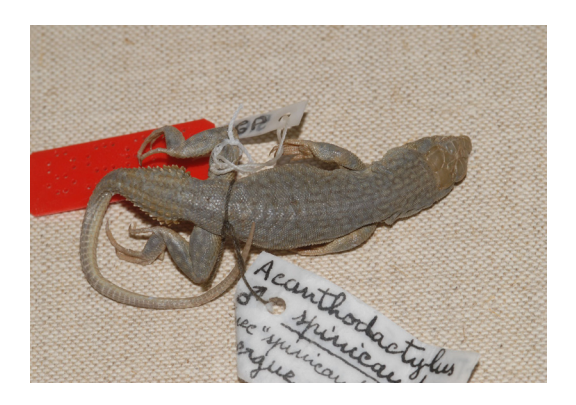
Figure 1. Specimen MNHN-RA-0.8958, adult male, syntype of Acanthodactylus spinicauda . Notice the typical dorsal pattern and the enlarged tail basis covered in strongly keeled scales giving a spiny aspect to the basis of the tail; compare with figures 3 & 4.