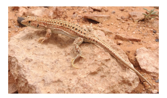
Figure 5. Acanthodactylus spinicauda, adult female, from locality 1b in Table 1, 22 April 2015.