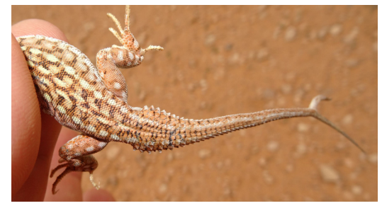
Figure 4 . Close up of tail basis, dorsal view, of an Acanthodactylus spinicauda adult male from locality 1 in Table 1, 11 March 2015.